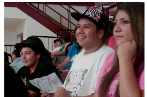
Youth enjoy activities at the summit.