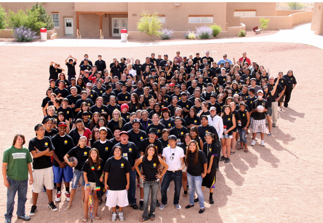
Intertribal Youth Summit participants.