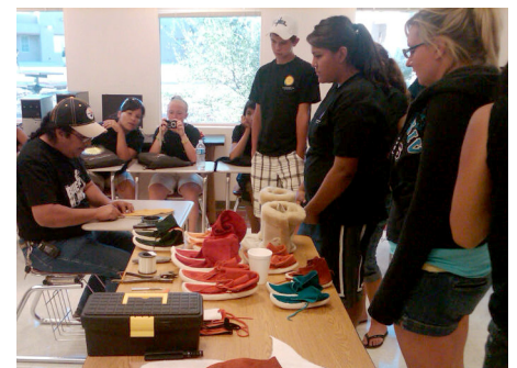
Youth watch intently as a Native American artisan makes moccasins. Numerous workshops at the summit focused on traditional arts and crafts, which included beading, drum making, and silversmithing.