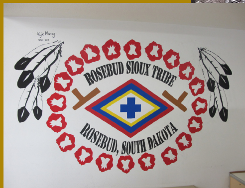
Student mural on boys' dorm wall using Native American symbols.

Students are also provided opportunities to participate in cultural activities, such as sweat lodge ceremonies. This practice is common in many Native American cultures, and students have been very responsive to this opportunity to seek spiritual, physical, and mental cleansing in a culturally rooted practice.